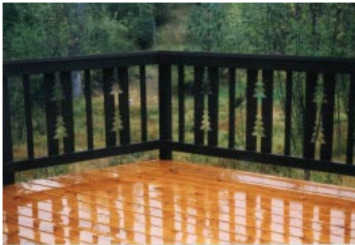
Second place winner: Bill Hudson's Yellow Cedar deck