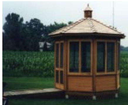
Midwest Gazebo: Winner of The BCL Deck Contest

Cedar tongue and groove (T&G) is one of the most versatile products we sell. Its also one of the most popular!