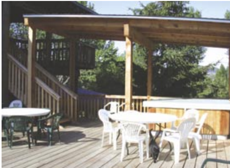
Connecting partially covered 2-level decks double this home's living space, providing both extra dining space, a hot tub area and an extension of an upstairs bedroom, where a summer bed can be placed.

Prices were less robust, with the median price falling off a bit from last month to $198,400, 1.5% above last year.