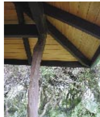
A koa log supports a yellow cedar overhang on a Hawaiian home's outdoor walkway.

Interested parties have asked for a further 60 days of public comment, after which HUD would decide whether to push ahead with its rule or revise it, the paper added.