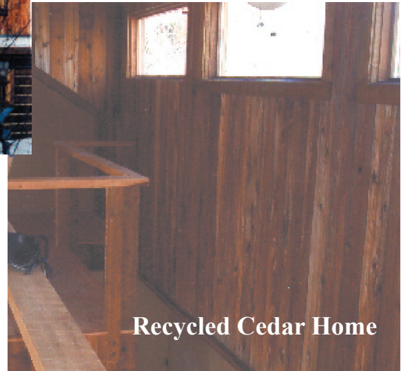
Recycled Cedar Home

Recycled 1 x 6 cedar creates a well worn effect when it comes to this woody home, where it was used as both siding and interior paneling.