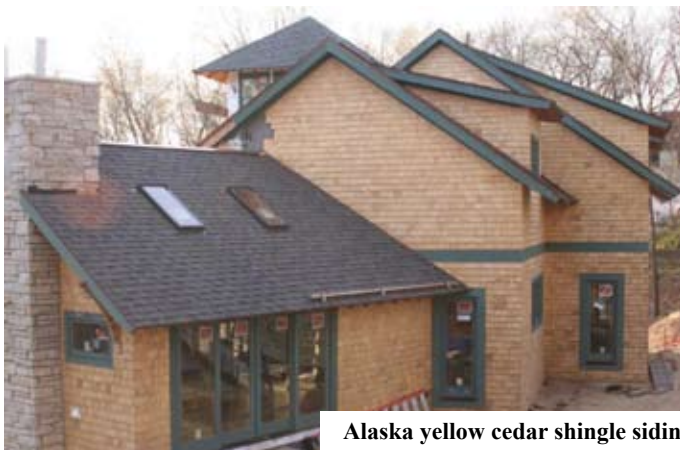
Alaska yellow cedar shingle siding

Home-foreclosure rates soared nationwide in the first quarter as consumers grappled with the rising costs of living. And while Florida recorded a decline in foreclosures, the state still has one of the 10 highest foreclosure rates in the nation, according to a recent report by RealtyTrac. The first three months of the year saw a 72 percent increase in nationwide foreclosures, compared with the same period of 2005. That's a rate of one for every 358 U.S. households. In Florida, the rate declined 14 percent -- a rate of one for every 247 households. Economists said a variety of factors -- including rising gas prices, interest rates, property taxes and insurance rates -- are impacting foreclosures. Many of those expenses will only get higher.